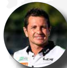
Randy de Puniet